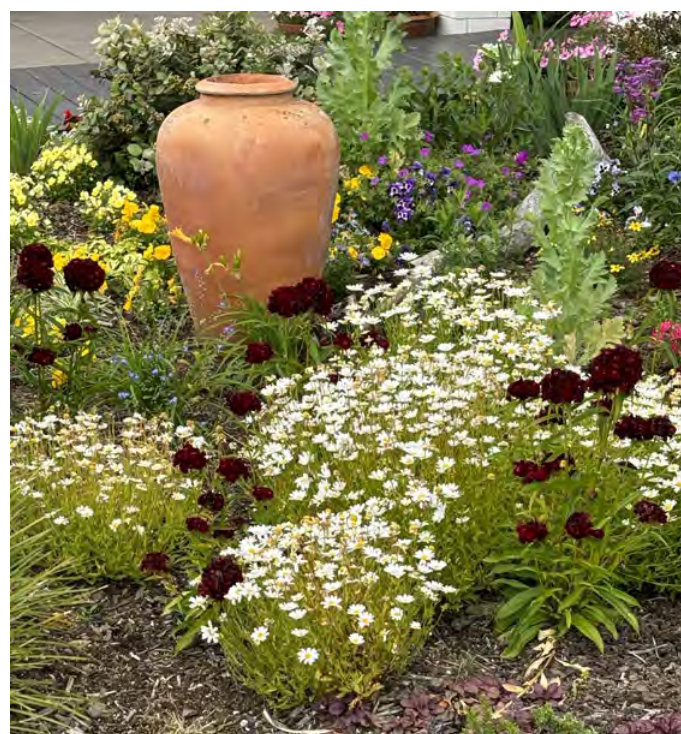
Bublitz Garden - 9 Mackillop Way

Please note the Rainforest Eatery will be open Wednesday to Sunday, from 10am to 4pm: Ph 067524143