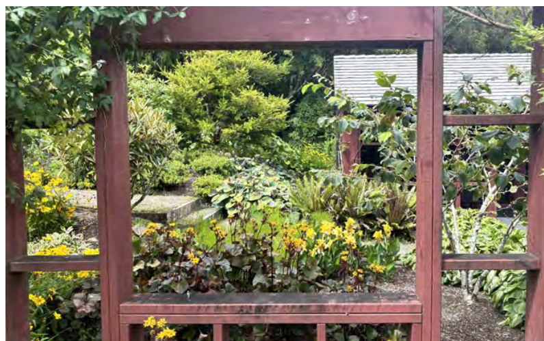
Keiller Garden in summer

A group of members, the majority of which join the weekly working bees held each Wednesday, potted a variety of perennials which had been lifted from various places around Pukeiti particularly the Keiller Garden. The plants will be offered for sale to members next year.