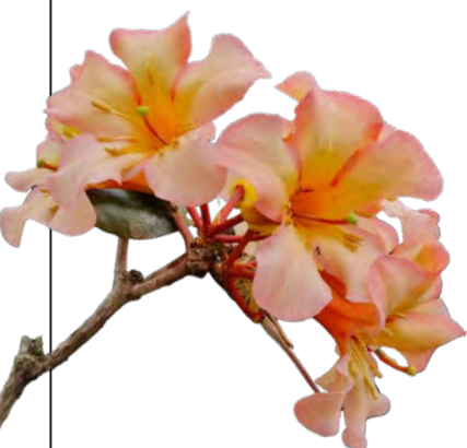
R. 'Rangitoto Sunrise'