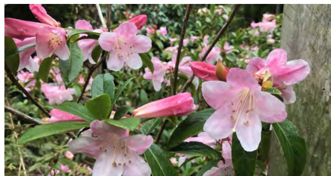
R. formosum 'Ten Tashi'